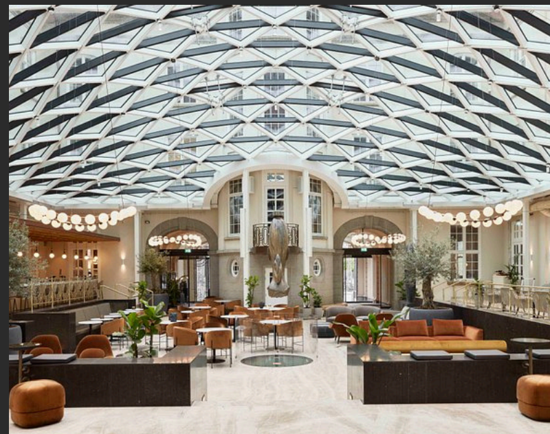
1 Villa, Copenhagen